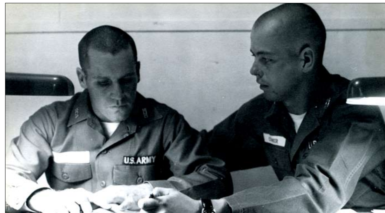
TOP: Candidates helped each other during study periods each evening and on weekends. BELOW: "The spirit of the bayonet!"

Buzz haircuts (usually taking less than a minute) were administered at an OCS barber shop, OCS related gear such as collar brass and black helmet liners were issued, personnel records were checked, and barracks bunk assignments were made.