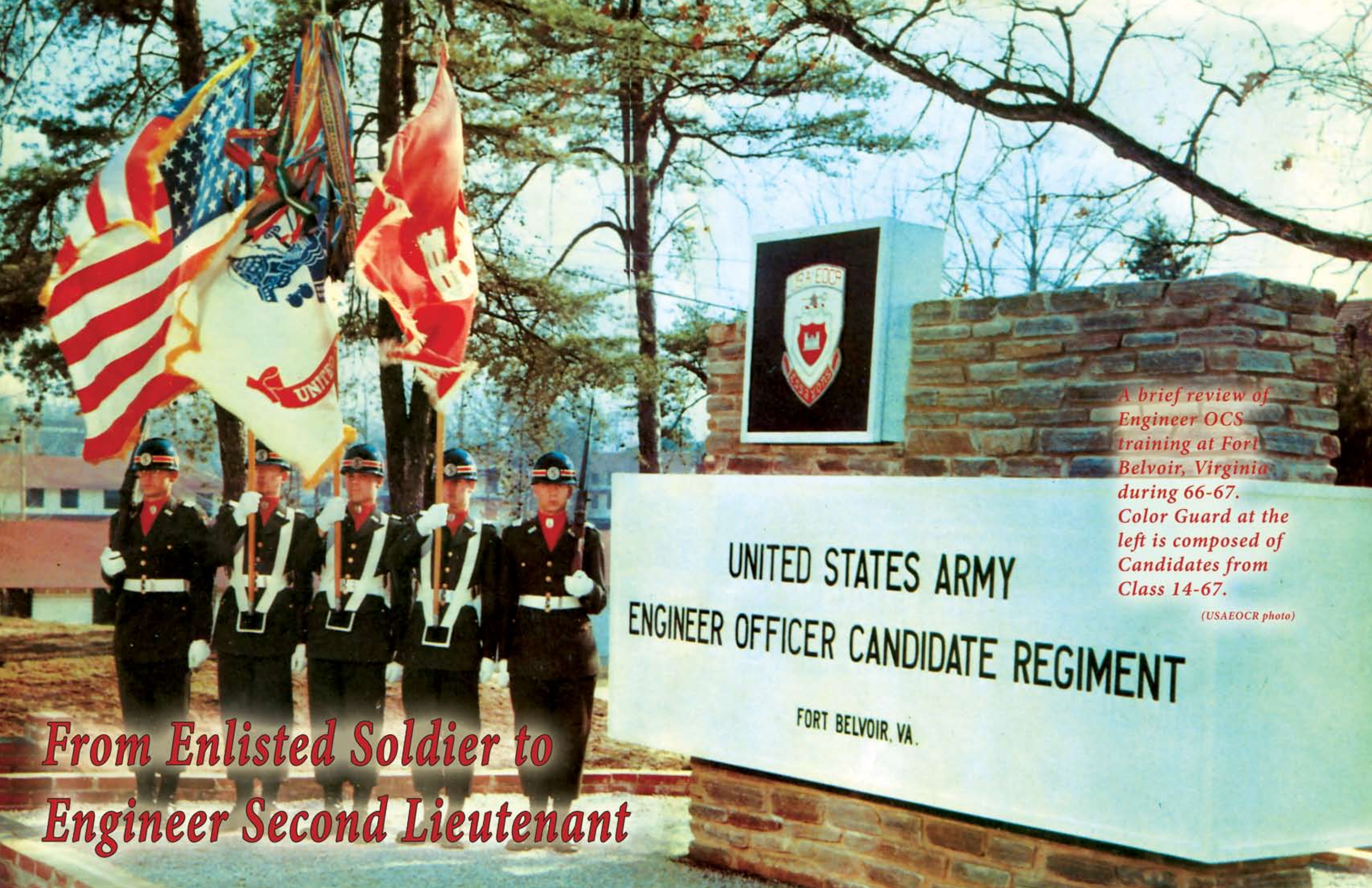
A brief review of Engineer OCS training at Fort Belvoir, Virginia during 66-67. Color Guard at the left is composed of Candidates from Class 14-67.