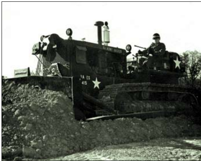
TOP: A Senior Officer Candidate pins on the newly attained "white tab" signifying transition to Junior Officer Candidate status. BELOW: A Senior Officer Candidate operates a piece of heavy engineer equipment during the latter weeks of training. FACING PAGE: Graduation was a special time for all...finally!

in areas involving other branches of the Army such as Infantry, Armor, Signal, Ordnance and Artillery. There was a need to study at night, and time was especially set aside to do so before "lights out" at a precise time. However, some continued to study with flashlights under wool blankets.